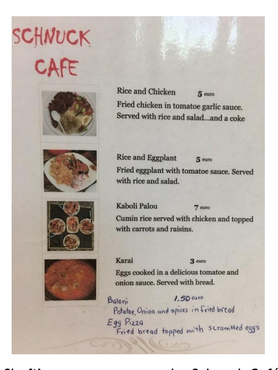
Shafi's current menu at the Schnuck Café